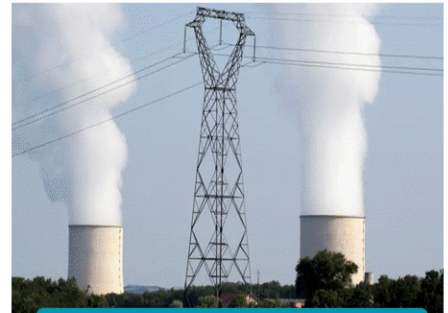
First nuclear plant of North India in Haryana

(C) Recently, Union Minister Dr. Jitendra Singh said that North India's first nuclear project is being set up in a small town called Gorakhpur in Haryana. He reiterated the government's commitment to the Jaitapur Nuclear Power Project and called it an important step towards India's clean energy future.