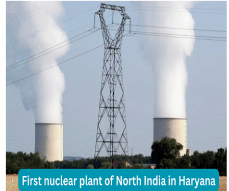
First nuclear plant of North India in Haryana

(C) Recently, Union Minister Dr. Jitendra Singh said that North India's first nuclear project is being set up in a small town called Gorakhpur in Haryana. He reiterated the government's commitment to the Jaitapur Nuclear Power Project and called it an important step towards India's clean energy future.