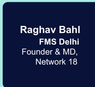
Raghav Bahl FMS Delhi Founder & MD, Network 18