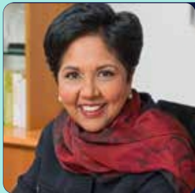
Indra Nooyi IIM Calcutta CEO, PepsiCo