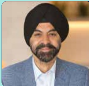
Ajay Banga IIM Ahmedabad CEO, Mastercard