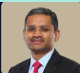
Rajesh Gopinathan IIM Ahmedabad CEO - TCS