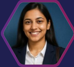
Vidhi CAT (MBA)