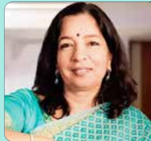
Shikha Sharma IIM Ahmedabad CEO - Axis Bank